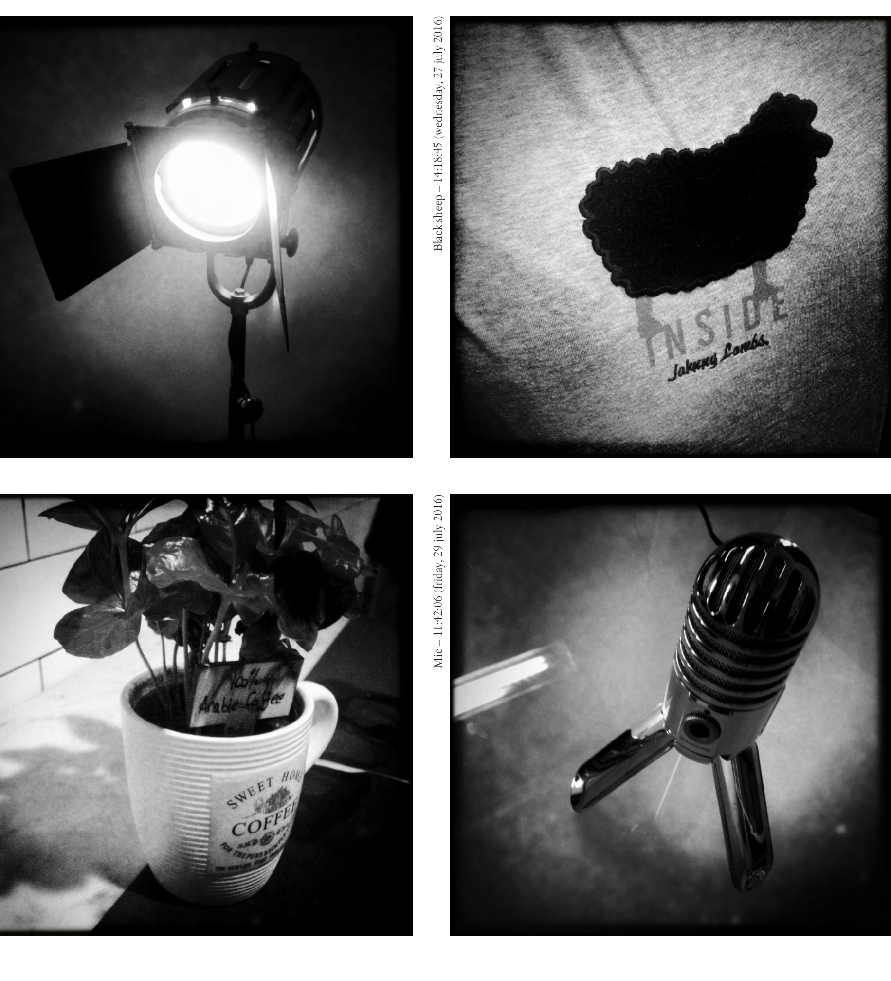
Coffee - 22:07:55 (thursday, 28 july 2016)