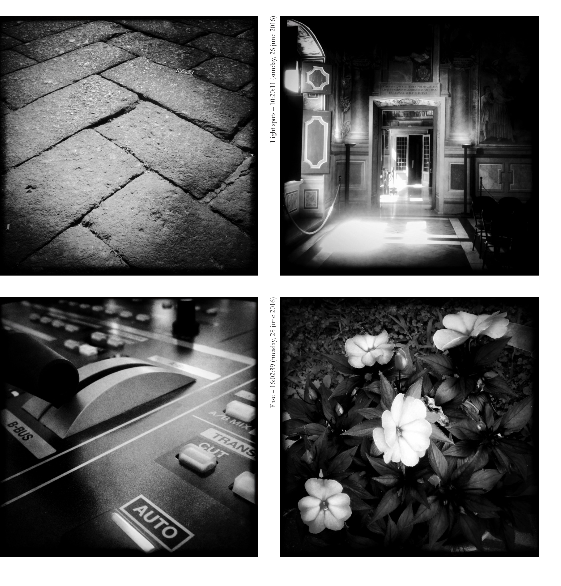
At work – 15:07:57 (monday, 27 june 2016)